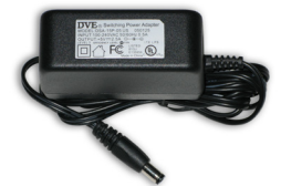
Additional AC Power Supply