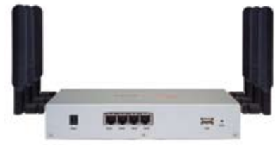
HotPort 7100 connectors