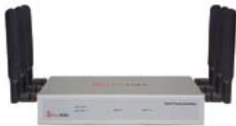
HotPort 7000 Indoor Mesh Node

The HotPort® 7000 MIMO infrastructure mesh delivers best-in-class performance with throughput of up to 400 Mbps, exceeding that of current wired solutions like T1, Fast Ethernet and OC-3 fiber, and provides an alternative to fiber or leased lines. The HotPort 7000 mesh enables delivery of multiple high-speed services over wireless, including high-resolution real-time video surveillance, broadband access, HDTV, multiple voice streams over IP and high speed-infrastructure backhaul.