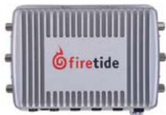
HotPort 7000 Outdoor Mesh Node