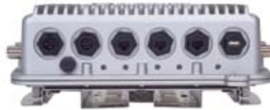
HotPort 7200 connectors