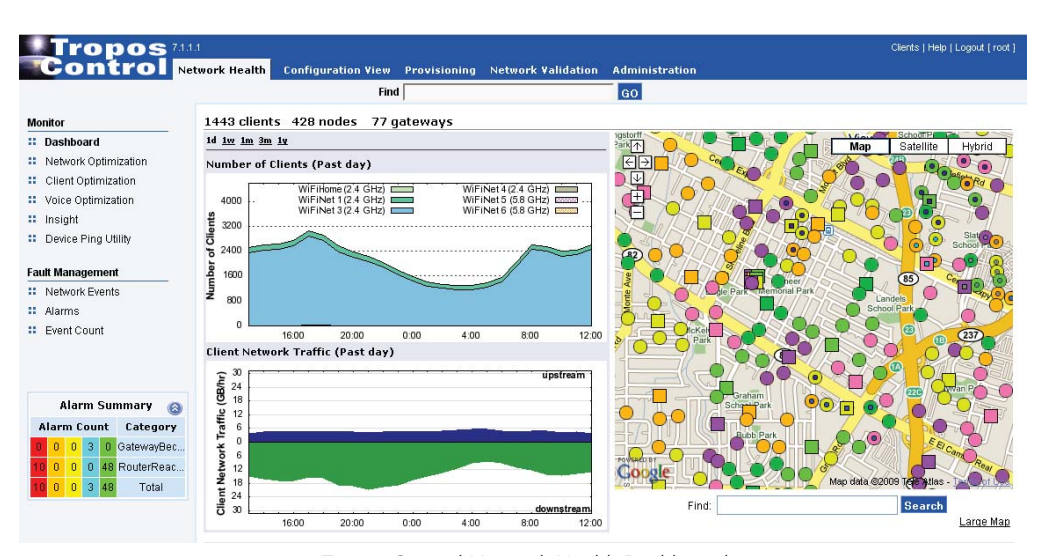
Tropos Control Network Health Dashboard