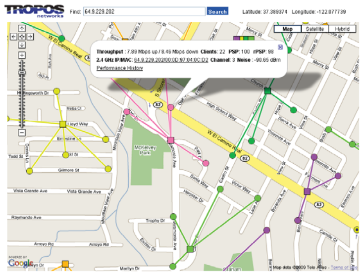
Tropos Control provides precise geographical views of gateways, nodes, and end-users.