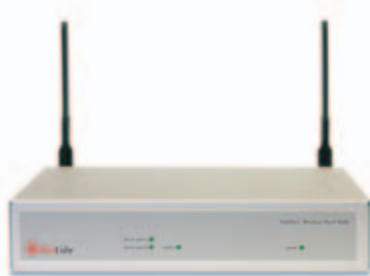
HotPort 6000 Indoor Mesh Node

Designed for seamless indoor and outdoor operation, the HotPort mesh network securely handles concurrent video, voice, and data applications, making it ideal for municipal, public safety, and industrial networks. The mesh's self-forming and self-healing properties enable rapid deployment and dependable operation. Firetide's AutoMesh™ routing protocol manages network load and traffic congestion to optimize mesh-wide performance and capacity.