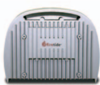
HotPort 6000 Outdoor Mesh Node

Firetide's end-to-end solution includes HotPort nodes for mesh infrastructure, HotPoint® access points for wireless access, HotView™ software for a complete management system, and HotView Controller™ for mesh and client mobility.