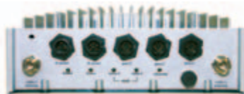
Outdoor HotPort 6000 connectors