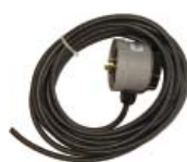
Streetlight AC Tap CBL-UPS-SL-25