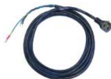
Line Cord UPS100-AC-Cord