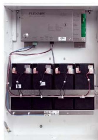
Front view MPS48-7 shown with batteries and AC service installed

Battery heater mats Batteries 277Vac step down transformer 347Vac step down transformer Street light power tap Power cord