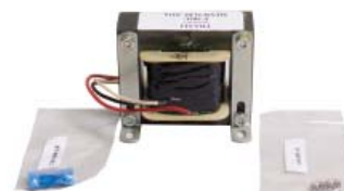
Step-down Transformer MPS-SDXB, MPS-SDXC