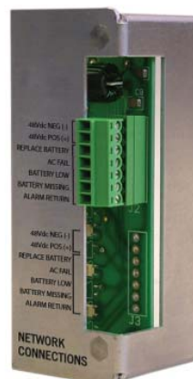
MPS48-7F Interface Module