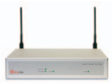
HotPort 6000 Indoor Mesh Node

Designed for seamless indoor and outdoor operation, the HotPort mesh network securely handles concurrent video, voice, and data applications, making it ideal for municipal, public safety, and industrial networks. The mesh's self-forming and self-healing properties enable rapid deployment and dependable operation. Firetide's AutoMesh™ routing protocol manages network load and traffic congestion to optimize mesh-wide performance and capacity.