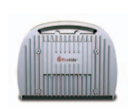
HotPort 6000 Outdoor Mesh Node

Transportation: Reliable Wi-Fi access with high speed mobility and sustained bandwidth over a linear topology.